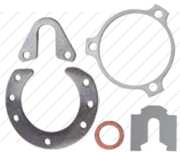
Precision Shims & Thin Metal Stampings