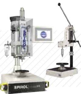
Pin Installation Technology