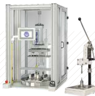
Compression Limiter Installation Technology

Please refer to www.SPIROL.com for current specifications and standard product offerings.