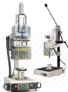
Insert Installation Technology