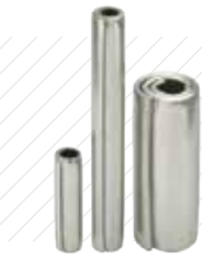
Coiled Spring Pins