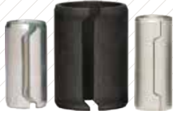
Alignment Dowels / Bushings