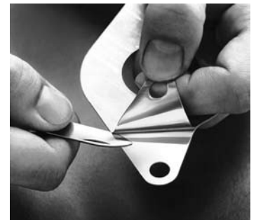
Surface Bonded Shims

Drawbacks: Sometimes it is difficult to peel layers, and discarded layers must be scrapped.