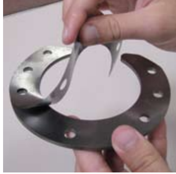
Edge Bonded Shims are easy to peel. Unused layers can be used for another application.

Benefits: Easy to peel layers. Simple and inexpensive design, maintains constant preload between service intervals, and allows for the easiest service in the field with less parts stocking. Unused layers may be used in a different assembly.