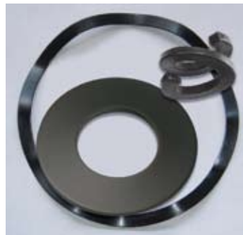
Wave Spring, Belleville Washer and Coil Spring

Drawbacks: Dissipating preload as spring fatigues, and allows yield during impact which may be detrimental to assembly (such as with a ring and pinion meshing gear set). Difficult to adjust.