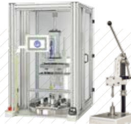
Compression Limiter Installation Technology

Please refer to www.SPIROL.com for current specifications and standard product offerings.