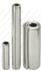
Coiled Spring Pins