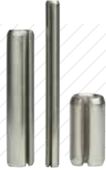
Slotted Spring Pins