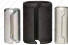
Alignment Dowels / Bushings