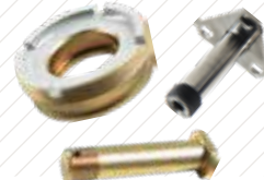
Machined Aerospace Components