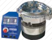
Parts Feeding Technology