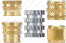
Threaded Inserts for Plastics