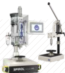
Pin Installation Technology