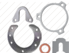
Precision Shims, Washers & Metal Gaskets