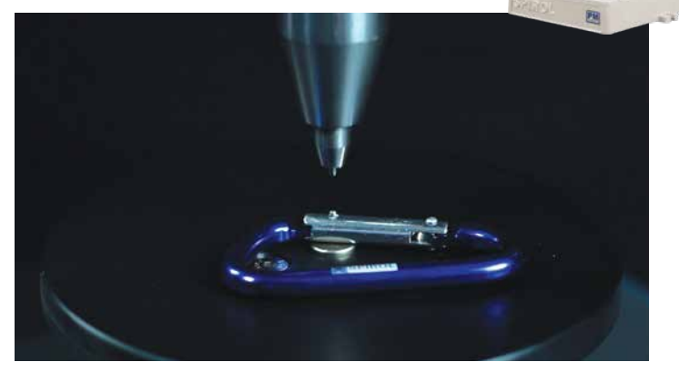
Alignment fixtures are designed to accommodate customer products.

For very small pins, please consider the use of a SPIROL PR machine to eliminate the need for the operator to handle the pin.