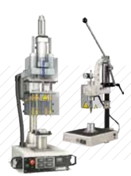
Insert Installation Technology