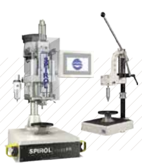
Pin Installation Technology