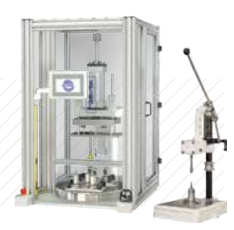
Compression Limiter Installation Technology

Please refer to www.SPIROL.com for current specifications and standard product offerings.