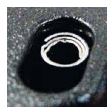
Figure 4. Using an improper

Figure 5. Flip side of the same installed pin.