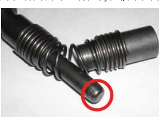
Figure 3. Worn insertion quill

the quill will be too small such that it will not cover the entire end of the Coiled Pin. As described above, the quill will press on the inner coils of the pin, and insertion issues will arise.