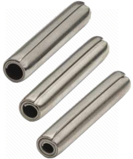
Coiled Spring Pins are offered in light, standard and heavy duty to meet application-specific requirements

While 302/304 austenitic stainless steel Coiled Pins provide excellent corrosion protection, this material is not an appropriate solution when the pin will be subject to dynamic loads, or where strength and fatigue resistance must equal or exceed that of high carbon steel. Alternatively, 420 martensitic chrome stainless steel provides an exceptional combination of strength and fatigue resistance - in addition to its inherent corrosion resistance.