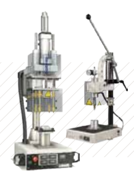
Insert Installation Technology