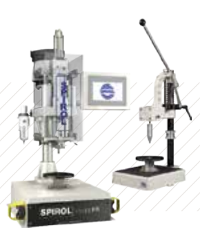
Pin Installation Technology