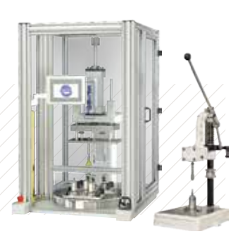
Compression Limiter Installation Technology

Please refer to www.SPIROL.com for current specifications and standard product offerings.