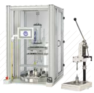
Compression Limiter Installation Technology

Please refer to www.SPIROL.com for current specifications and standard product offerings.