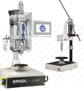
Pin Installation Technology