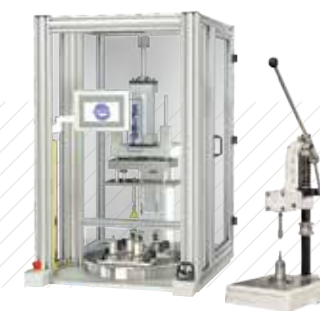
Compression Limiter Installation Technology

Please refer to www.SPIROL.com for current specifications and standard product offerings.