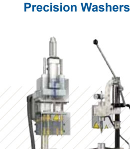
Insert Installation Technology