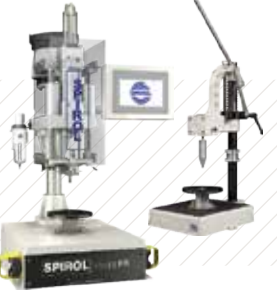
Pin Installation Technology