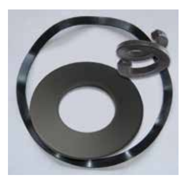
Wave Spring, Belleville Washer and Coil Spring

Drawbacks: Dissipating preload as spring fatigues, and allows yield during impact which may be detrimental to assembly (such as with a ring and pinion meshing gear set). Difficult to adjust.