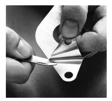
Surface Bonded Shims

Drawbacks: Sometimes it is difficult to peel layers, and discarded layers must be scrapped.