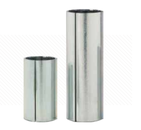
Rolled Tubular Spacers

• Practicality: Roll formed Spacers are designed with tolerances that meet the functional requirements of the application of separating two objects from each other by a desired distance. Typically, these tolerances are wider than machined or cut products which reduces costs, yet they still reliably meet the functional requirements of the spacing application. Unnecessarily close tolerances often require precision machining or the addition of secondary operations that substantially increase cost with no value added to the function of the Spacer.