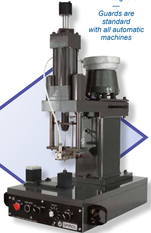
Model CR Semi-Automatic Vertical Pin Inserters

Options such as rotary index tables, pin sensing, force monitoring, and drilling and pinning combinations can be added for enhanced productivity, heightened process control and error-proofing.