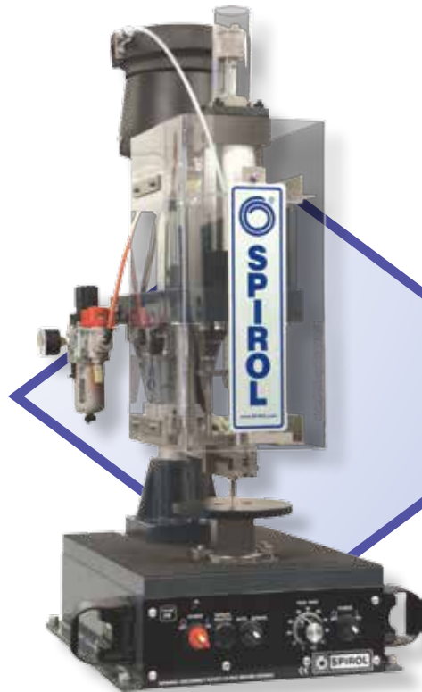
Model PR Semi-Automatic Vertical Pin Inserters

Easily accommodates all SPIROL Pin-Driving Chucks, SPD-101, CXA and CXD , which are selected based on pin size.