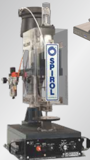
SPIROL Model PR Semi-Automatic Pinning Machine